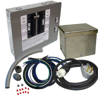
50 AMP Model 6296