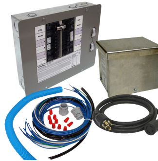
30 AMP Model 6295