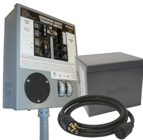
30 AMP Pre-wired Model 6294